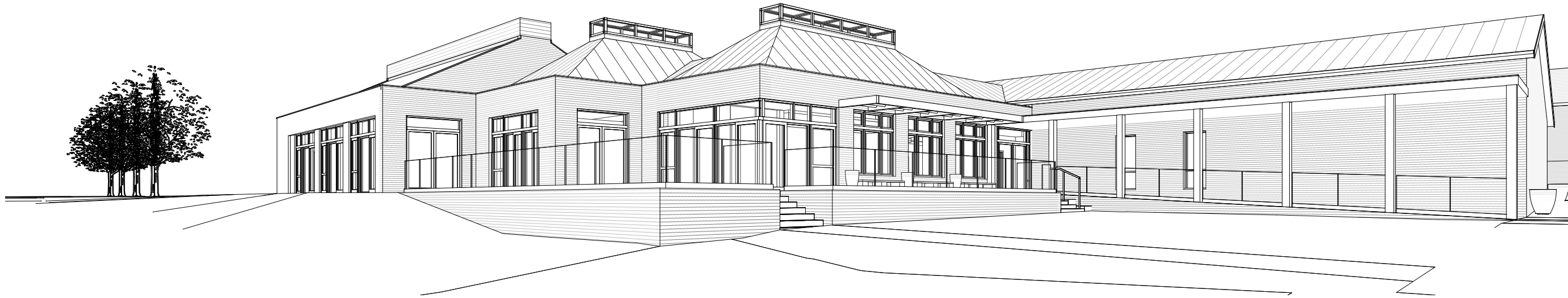
3D View 01