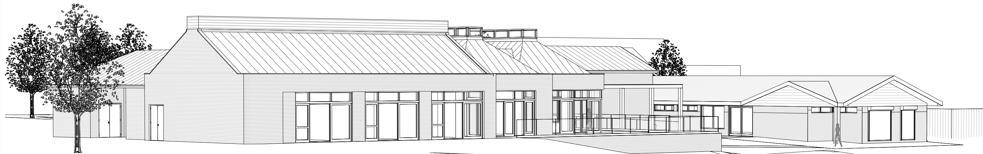
3D View 09